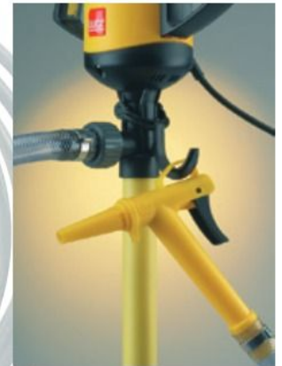
Hook for storing nozzle and power cord at the pump