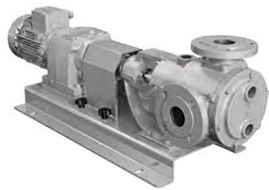
> Food Series (With Jacketed)