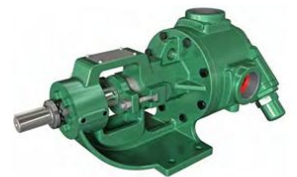
With Relief Valve Threaded Connection Ports