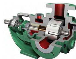
> The Cover & Bracket Jacketed Cutted Way