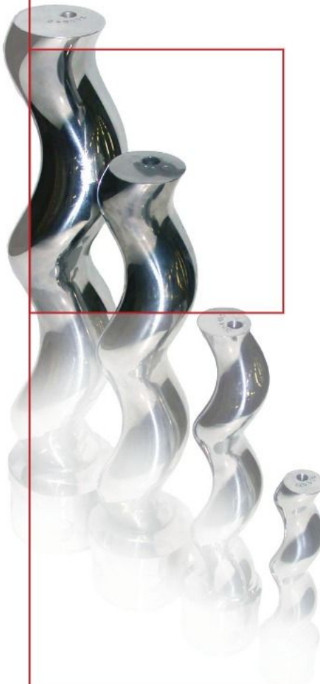
Hopper with auger