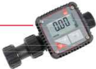
Flow meter TR3