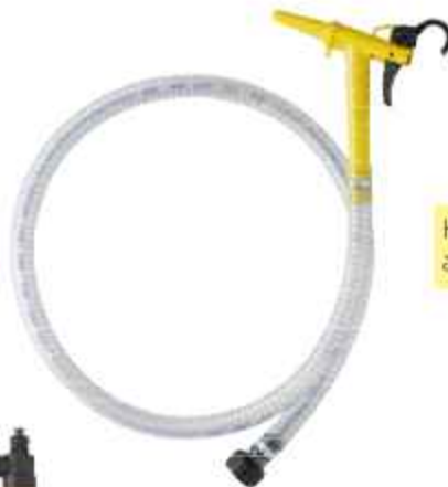
Hose set with nozzle and hose clamps