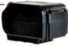
Rechargeable battery with Li-Ion technology